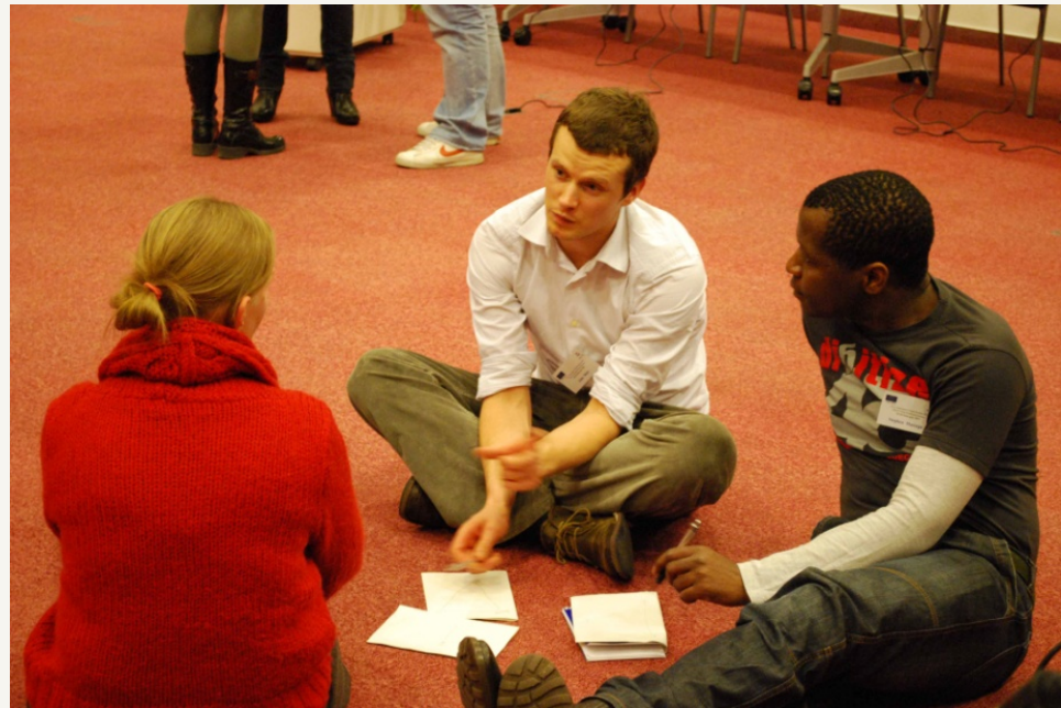
Short course in Budapest 2011